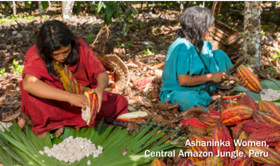
Ashaninka Women, Central Amazon Jungle, Peru

Learn about the tropical origins of chocolate with a fascinating look at cacao cultivation, harvest, and fermentation in Peru and Mexico. Meet the farmers preserving heirloom cacao varieties and discover cacao’s exotic relatives—Macambo, Copuazu, and Cupui. Conclude the adventure by exploring traditional chocolate-making techniques and savoring a rich, authentic cacao drink crafted during the presentation.