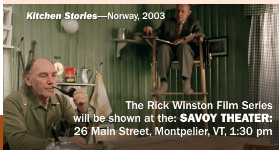
Kitchen Stories—Norway, 2003

In this feel-good romantic comedy by Lone Scherfig, nine quirky Danes find unexpected connections through a beginner Italian class. With its blend of humor, emotional honesty, and relatable charm, the film explores how love and community can grow from even the most unlikely situations.